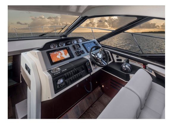
The well-designed control station features standard SmartCraft® diagnostics, VesselView display, plus a Raymarine® Radar/Chartplotter & VHF radio.

There comes a peace at the very center of everything, when the world pivots around you in perfect balance. Some people spend a lifetime trying to find this spot. Others simply settle into the solarium-like covered cockpit of the Sundancer 510. Light streams in through endless acres of glass above and to every side and even follows you when you head below under SkyFlow's glass cathedral ceiling over the galley and salon. Dissolving the separation between indoor and outdoor helped the 510 win the AIM Marine Group Editor's Choice Award. Its technical prowess and inspired execution ensured the win, and the peace you will find therein.