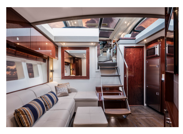
Going below has never been this bright of an idea. The 510 Sundancer was engineered with patented SkyFlow Design™ dissolving the line between indoor and outdoor spaces, and allowing natural light deep into the yacht like never before.