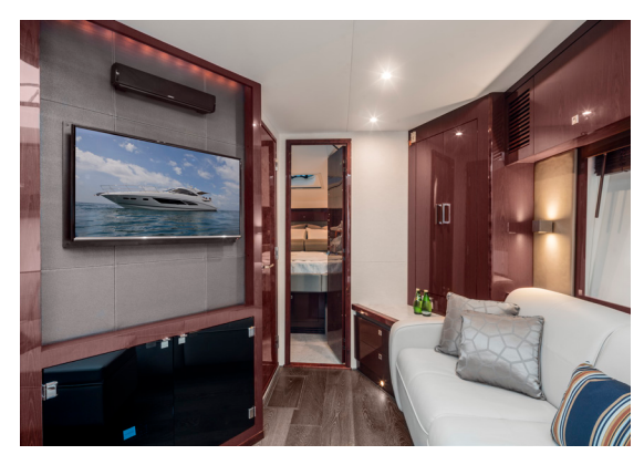
The lower salon connects with the upper sunroom beneath a long stretch of glass, bringing bright sunlight into the interior. It's just another way that Sea Ray is making better yachts.