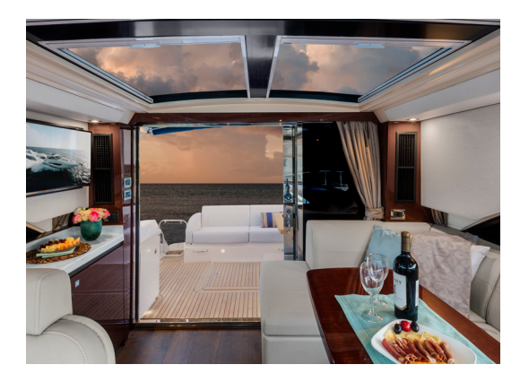
Everyone loves a brightly lit room. The 510's enclosed sunroom with oversized deckhouse windows and expansive pneumatic sunroof lets the outside in while providing comfortable, climate-controlled living without the need for canvas. You'll relax in the inviting solarium, wishing a room so perfect were in your home.