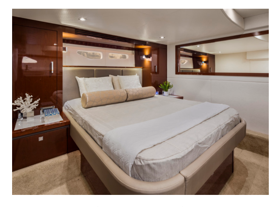
The water's peaceful solitude is part of its unique beauty, but great quiet time doesn't need to stop there. The 510's full-beam mid-ship master stateroom has a private head, commodious closet system and welcoming sitting area, truly making it your own private oasis.