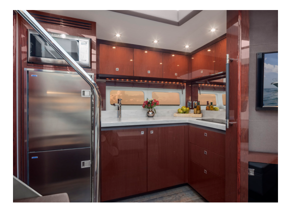
Fully equipped galley includes stainless-steel microwave/ convection oven, refrigerator/freezer and solid-surface countertop with stainless-steel sink.