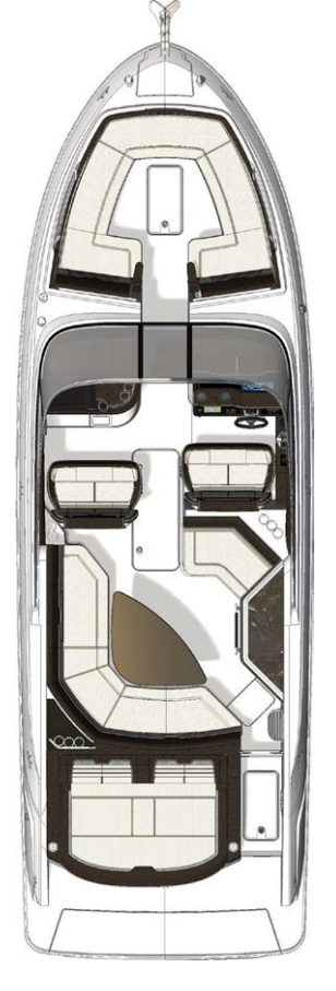
STANDARD SEATING PLAN

Aluminum Tri Axle Trailer with Bunks & Tri Axle Disc Brakes