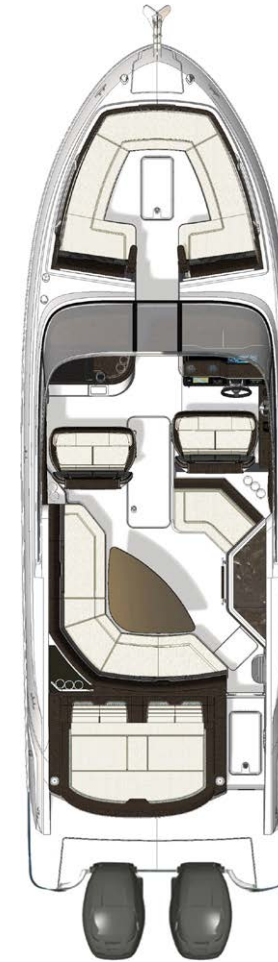
STANDARD SEATING PLAN