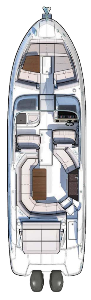
ACCOMMODATIONS PLAN Shown with optional equipment

CABIN Shown with optional port berth upgrade amenities