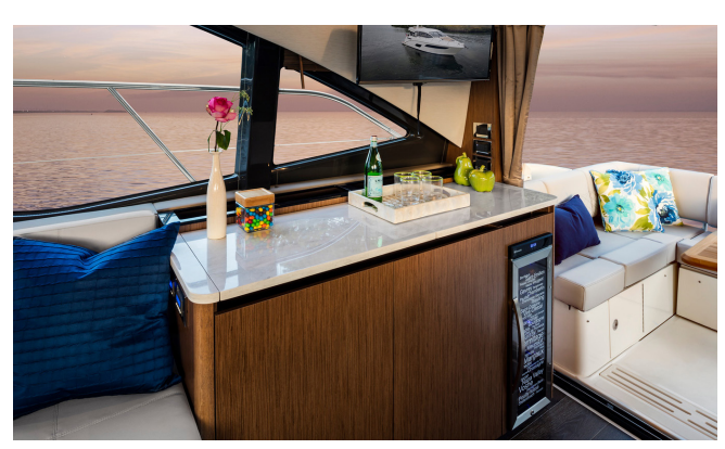
Large side deck windows & wide entry door fill this elegant salon with plenty of light. Upgraded amenities include an optional plush sofa that converts to an extra guest bed.