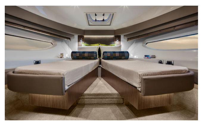
Versatility abounds in the plush forward stateroom with ingenious twin scissor bunks that glide together to form a queen-sized bed with storage below.