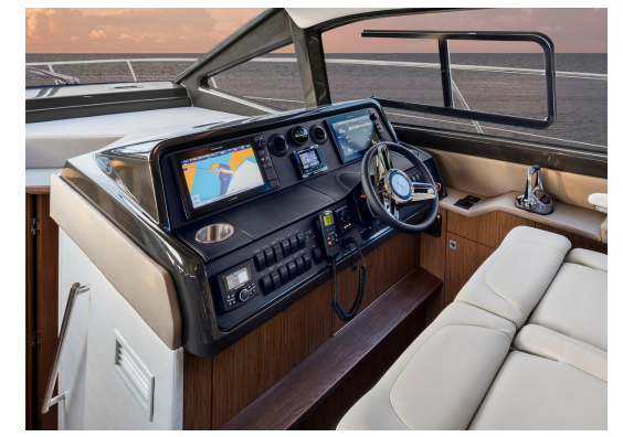
Tiered, instrument panels provide loads of space for the SmartCraft® VesselView display, as well as illuminated rockers and Raymarine® eS12 Radar/ Chartplotter combo display.

Aesthetically, the 460 carries forward the cutting-edge design cues created in the latest Flybridge generation - including crisp, clean lines - while also incorporating all the key features that have taken our sport yachts to the next level.