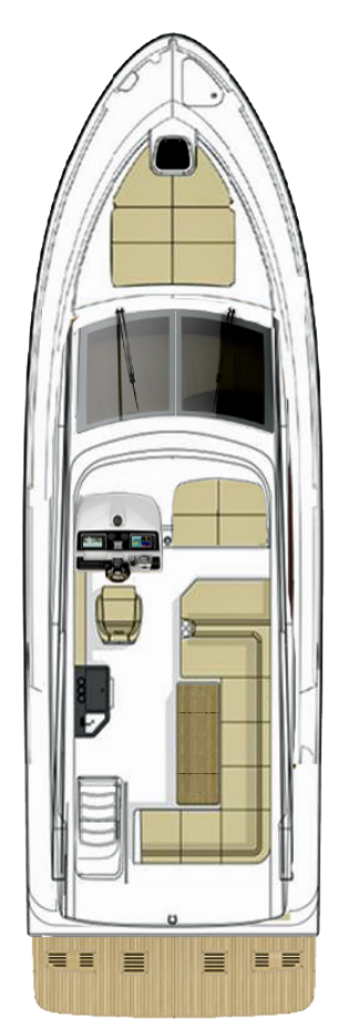
BRIDGE / DECK LAYOUT

NOTE: Some features and options may not be available when a boat is built for regions outside North America and/or has CE Certification. Boats ordered with 220V/50 cycle electrical systems will have the appropriate appliances in the corresponding voltage.