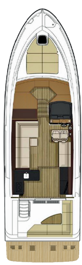
SALON / COCKPIT LAYOUT