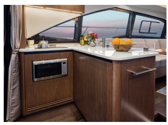
The galley is gourmet-ready, with stainless steel appliances, streamlined solid-surface countertop, fine wood flooring, and plentiful storage.