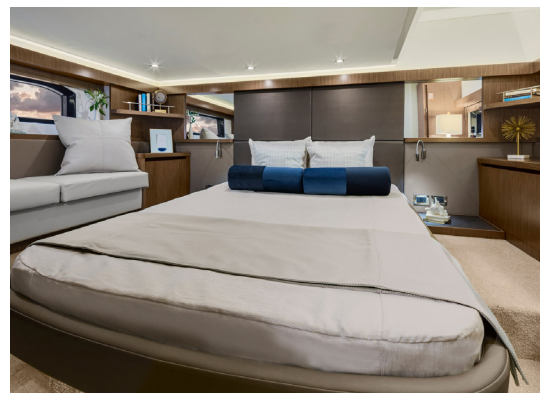
Large hull windows fill this elegant full beam, aft master stateroom with light and has a standard 32" LED TV w/ Blu-ray™ player.