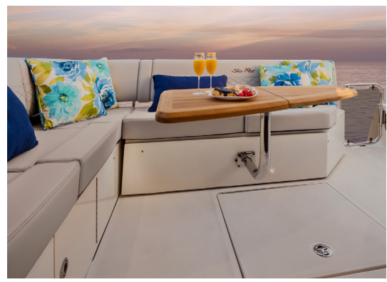
Social cockpit layout with wrap around seating and actuated aft seat that expands cockpit for an additional 16" of space. An optional gourmet transom space features a solid surface countertop with grill and sink.