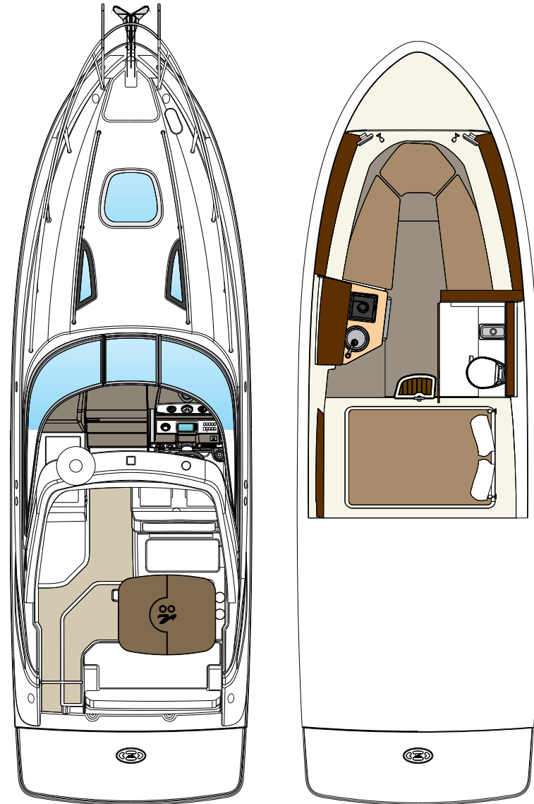
DECK / COCKPIT