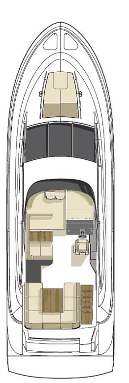
BRIDGE LAYOUT (Shown w/Opt Features)

NOTE: Some features and options may not be available when a boat is built for regions outside North America and/or has CE Certification. Boats ordered with 220V/50 cycle electrical systems will have the appropriate appliances in the corresponding voltage.