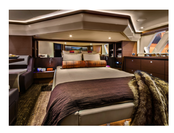
Bringing along as many friends or family members as you want is a part of cruising's fun. The 510's three-stateroom layout means time on the water in comfort for everyone including a lattice-style headboard and double dressers in