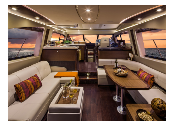
The open, spacious salon with a sliding door leading to the cockpit gives the vessel a feeling of abundance. Upper and lower helm stations mean you can captain from wherever your crew wants to congregate.

Think of consummate hosts you've met. They support social interaction with beautiful settings and all the right amenities and offerings to bring life to the party, keeping the mood bright, lively and happy. You've just imagined the Fly 510, with its highly functional social zones and crowd-pleasing features to keep you and your guests at full-smile. SkyFlow Design circulates light and air throughout the boat. The galley, salon and cockpit combine like an indoor/outdoor great room, and the expansive bridge layout is the icing on the cake. Hosting is easy in such an environment. And then when the pace has slackened, a full-beam master suite breathes peace into every weekend getaway.