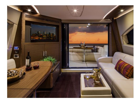
Room to breathe. The Fly's open floor plan on the upper level allows a continuous flow of light, air and conversation through the salon and galley. You'll find that here, conversation comes easily and the numerous windows stream in glorious sunshine.