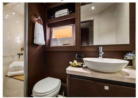
Elegant luxury features and designer head appointments make the Fly 510 unlike any other yacht in its class.