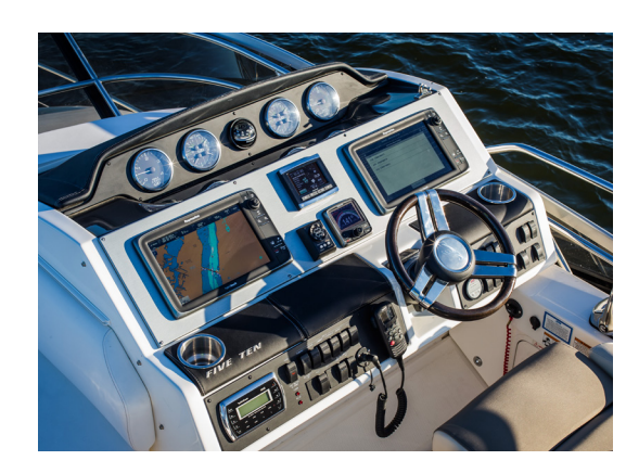
Power and security go hand in hand with state-of-the-art Raymarine® electronics and navigational equipment.