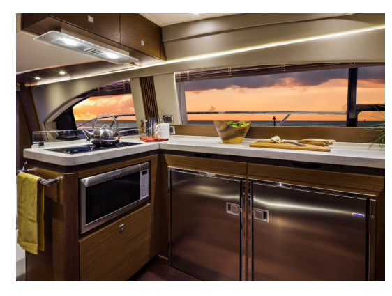
A gourmet galley with solid surface countertop and undercounter stainless steel refrigerator and freezer makes entertaining a pleasure.